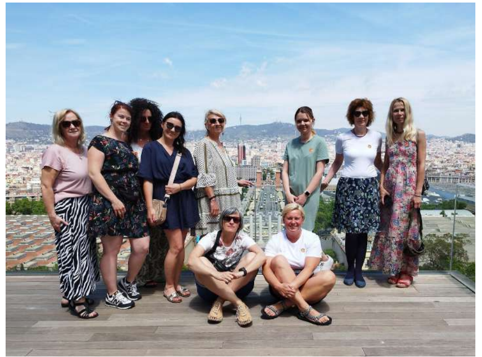
We had the opportunity to exchange our experiences with teachers from all over Europe